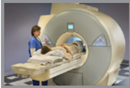
Magnetic Resonance Imaging (MRI) Machine

Helium has a very low temperature and boiling point, and therefore remains in its gaseous form until it is cooled to extremely cold temperatures. It is also the lightest of all the Group 18 noble gases and is "lighter than air." These two properties combined with helium's unreactivity make it the perfect element for use in a variety of different applications such as inflating balloons and blimps, shielding during welding operations, pressurizing fuel tanks in liquid fueled rockets, cooling superconductive magnets, and for making our voices "squeaky!"