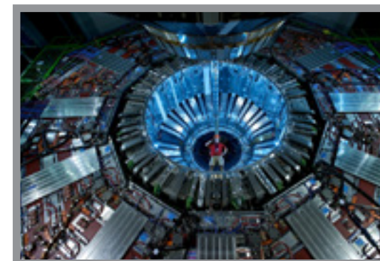
Large Hadron Collider

Helium is the second element on the Periodic Table of Elements. It is the first noble gas that we encounter on our trip around the table, and that means that it is also an inert gas. Inert means that the element is not very active, and will not combine with other elements or compounds. As a matter of fact, there have been no compounds of helium ever made! The reason that helium and all other noble gases are inert is because they have completely filled electron shells. They do not need any other electrons to "feel complete." But do not assume that helium is boring just because it does not form compounds with other elements. Helium may be colorless, odorless and tasteless, but it shows up in exciting process such as semiconductors, birthday balloons, welding and the Large Hadron Collider just to name a few.