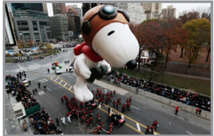
Macy's Thanksgiving Day Parade Snoopy Balloon

Today, helium is frequently found in laboratories that require extra-cold temperatures for experiments, because it can be chilled to temperatures near absolute zero. In fact, most of the helium that is used in the United States is used in industry and to cool the magnets in magnetic resonance imaging (MRI) machines. Liquid helium also cools the magnets of the Large Hadron Collider, the world's largest particle accelerator, down to -456.34 F (-271.3C). The National Aeronautics and Space Association, or NASA, uses liquid helium to keep rocket fuel cool prior to launch. Also many components of airplanes and spaceships are exposed to thermal cycling during their manufacturing process in order to harden the components and make them durable for the demands that will be put on them. This cold phase of this repeated cooling and heating process is normally achieved using liquid helium as well.