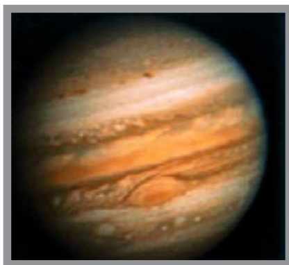
Photo of Jupiter

Now you may be asking that if helium has the ability to leave our atmosphere, how we still have a constant 0.0005% left. Well, the answer lies in the formation of helium deep within the Earth's crust. Helium only exists in Earth's atmosphere because it is constantly resupplied by the decay of radioactive elements such as uranium and thorium. This radioactive decay process was not understood however for many years after the original discovery of the element Helium. Let's take a walk through history and discover how helium was discovered and how constant radioactive decay allows us to use it for our birthday party balloons.