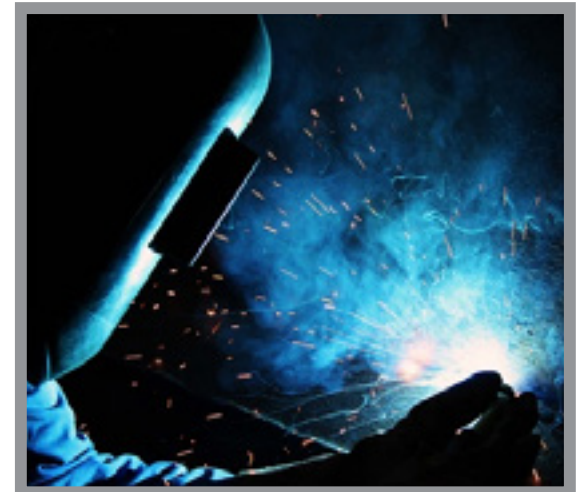
Welding under inert Helium gas

Helium is also used during welding operations due to its inactivity. Welding is a process by which two metals are heated to high temperatures in order to join them to each other. Welding however does not work well in "normal" air due to the presence of oxygen. At high temperatures, the metals are able to react with the oxygen in the air to form metal oxides. If this occurs, they are less likely to form a solid bond and therefore welders often work in a container of helium. The metals do not react with the helium and therefore a stronger bond is formed.