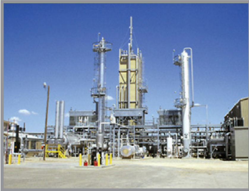
Crude helium enrichment unit